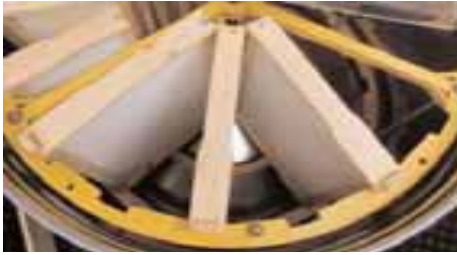
Holds 18 9 1/8" Frames