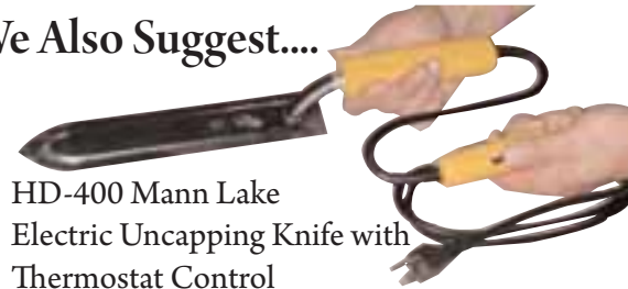
HD-400 Mann Lake Electric Uncapping Knife with Thermostat Control

Thumb controlled thermostat for the easi- est operation available.