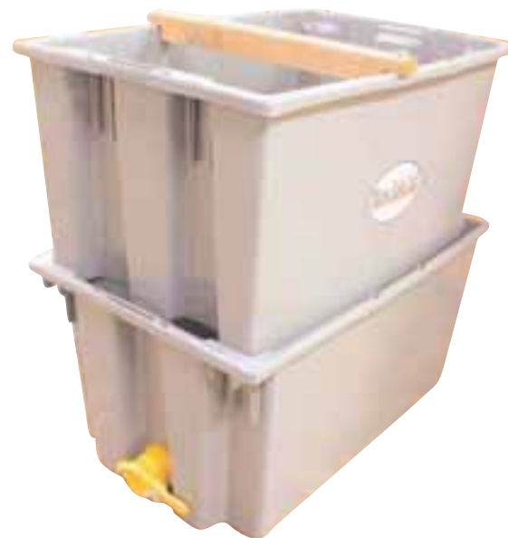
HH-231 Plastic Uncapping Tank

Thumb controlled thermostat for the easi- est operation available.