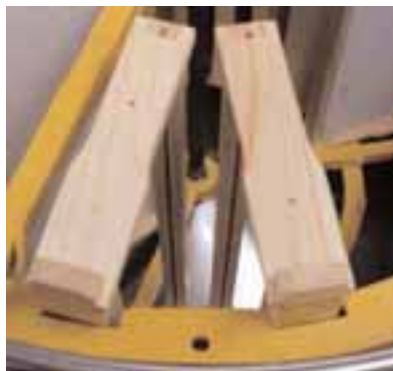
Holds 18 5 3/8" Frames