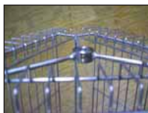
Picture of 6/3- frame basket (outside of the extractor)

The basket is supported by the allan screws at the top & bottom of the basket.