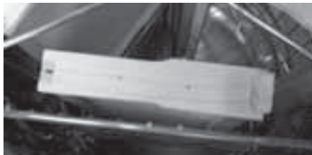
Holds 3 6 1/4" Frame