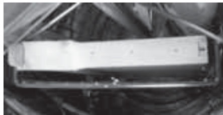
Holds 3 9 1/8" Frame