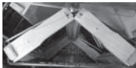
Holds 6 5 11/16" Frame