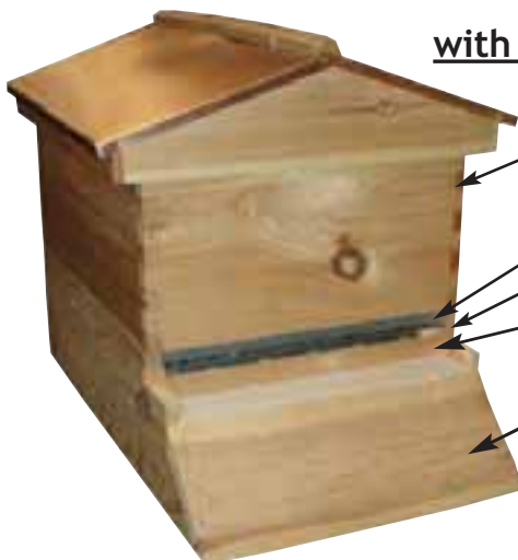
FRONT VIEW of a hive with bottom board and hive stand.