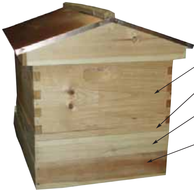
REAR VIEW of a hive with bottom board and hive stand.