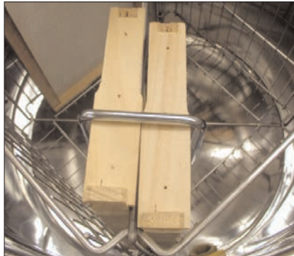
6 1/4" (15.88 cm) & 5 3/8" (13.65 cm) Frame Placement

Frames should be uncapped prior to extracting. When extracting 9 1/8" (23.18 cm) frames with wax foundation, the frames will need to be rotated during extraction. Extract side one approximately 50%, turn the frame to side 2 and extract 100%, then return to side one and extract the remaining 50%. Rotating the frame will lessen the occurrence of blowouts in the foundation from the weight of the honey. If plastic foundation is used, it is possible to extract each side 100% before turning. 6 1/4" (15.88 cm) and 5 3/8" (13.65 cm) frames are placed radially as shown. Halfway through the extracting process you may want to move the left hand frame to the right hand position and vice versa. Keep your honey gate open when extracting to ensure the basket moves freely. Your extractor is not intended to be a storage tank. Promptly move any honey to a storage container or bottling tank.