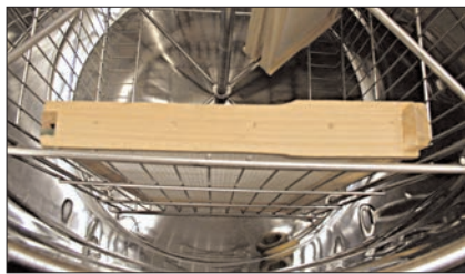
9 1/8" (23.18 cm) Frame Placement