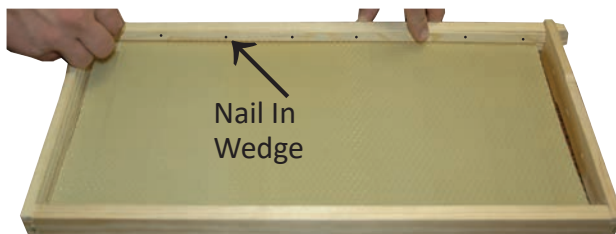
Nail In Wedge

Insert the bottom of the foundation into the groove at the bottom of the frame. Push the top of the foundation into the void left by the wedge at the top of the frame.